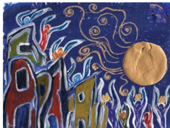
The Golden Pilgrimage by Carmelle Beaugelin Inspired by Matthew 2:1-12